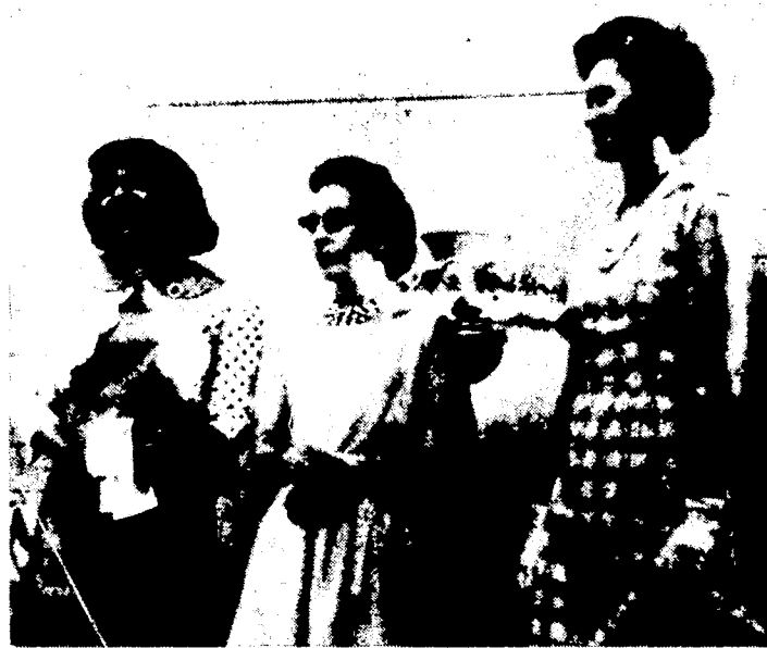
STUDENTS EXHIBIT THEIR OWN CREATIONS