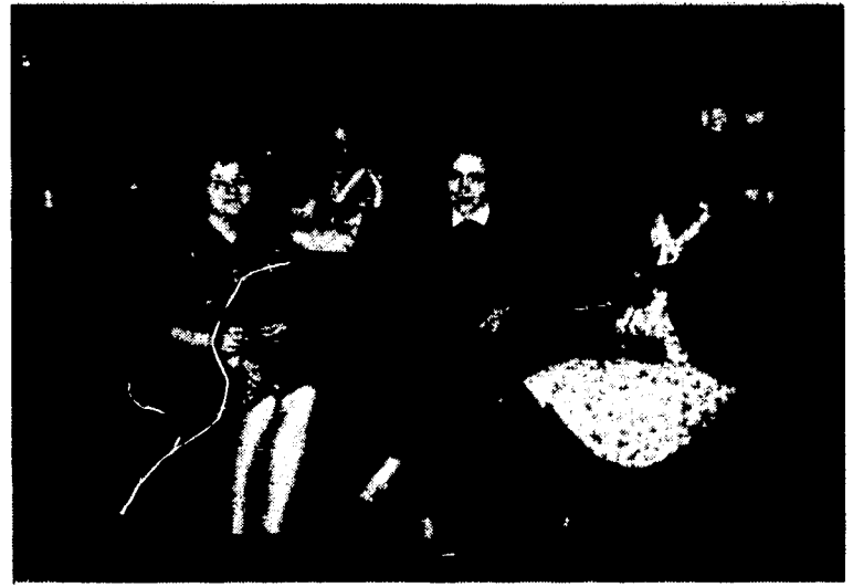
HOME MANAGEMENT AIDE SEWING CLASSES