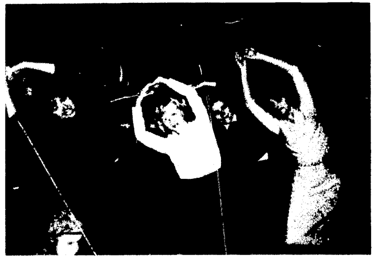
SELF IMPROVEMENT CLASSES IN ACTION